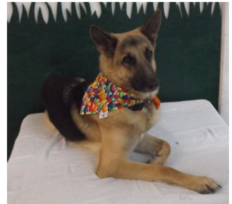
Observing with caution.

At his medical exam it was determined that poor Roger was suffering from giardia. He was treated and placed in a foster home for some desperately needed TLC. Roger proved to be a sweet, but nervous dog. All it took was a raised voice and Roger would flatten to the ground in fear. He showed signs of extreme anxiety and would not settle down unless he was in a crate. A holistic vet was consulted and a variety of remedies were prescribed to help him relax.