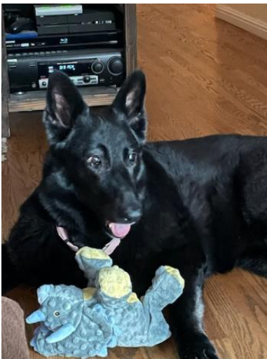
A special toy for Retha