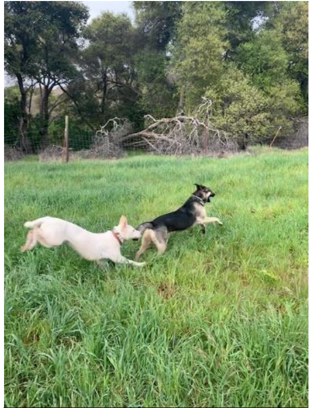
More fun in the grass

Rich says it will be several months to get all of the needed work done. But the land is coming back – green on the hills, wild turkeys and ducks on the pond.