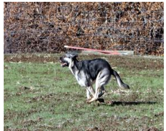
And look at Scout now!