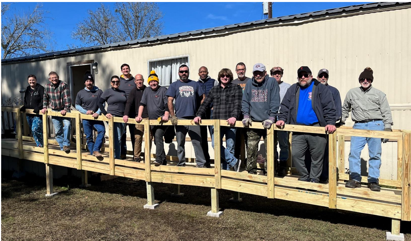
Magnolia Bible Church, BCKK Engineering and Independent Volunteers