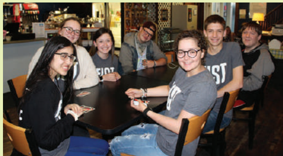
FIST members at Cahoots Game Night

FIST is a student-led organization, comprised of 19 students in grades 8-12 from Hamilton, Angola, and Fremont. They meet monthly to vote on grant requests and work together to make decisions about how they will serve the community. FIST members run the meetings, go through an agenda, and take minutes to note their discussions. SCCF offers administrative and financial support, helping them navigate the professional world as high school students with an interest in giving back.