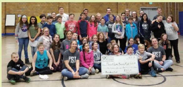
FIST members at Pleasant Lake Elementary School