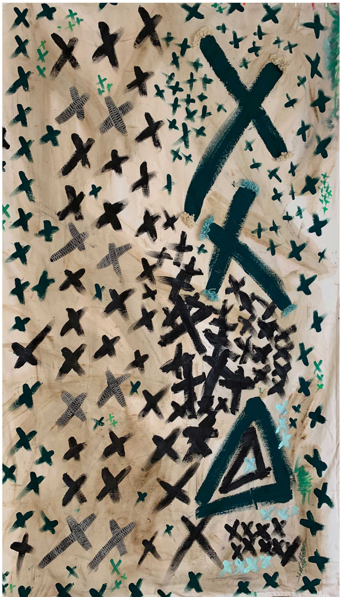
Talisman V Flashe Paint, Plastic Paint, Henne, Pigmented Raw Wool & Acrylic Marker on Berber Tent Fabric - 240 x 140 cm - 2019