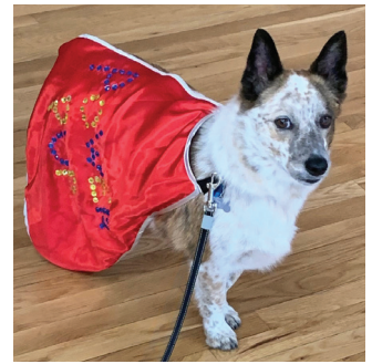
Power Pup teaches how to make healthy choices!