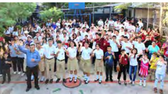
Celebrating clean water flowing again at Plan de Amayo, Caluco, El Salvador.

The story of the Plan de Amayo water system is a powerful reminder that our work is never truly finished. It's about building relationships, empowering communities, and creating a sustainable legacy of health and hope.