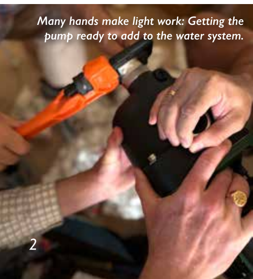
Many hands make light work: Getting the pump ready to add to the water system.

The words we heard again and again were powerful: Blessing. Beloved. Hope. Health. Renewal. Family. Community. Life.