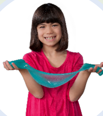
Safe Mad Science location camps