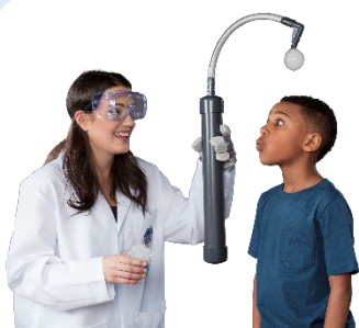
Private in home camps

Mad Science Summer Camps Combine Education and Entertainment to educate your children while they are having fun!