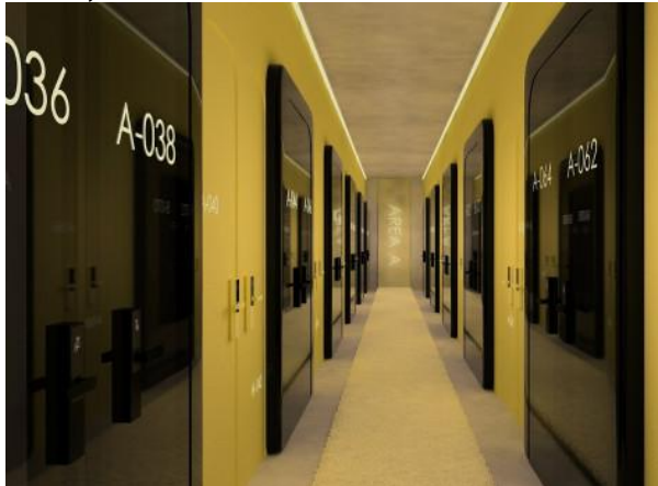
The Middle East's largest capsule hotel