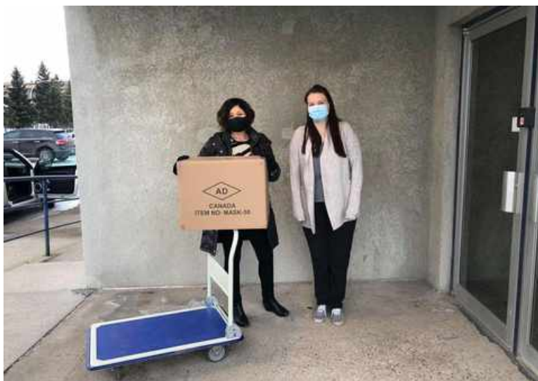
PPE's pickup at the JFED offices