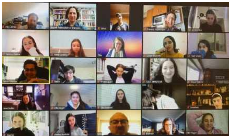
Tu Bishvat Mifgash

We “met” over Chanukkah and once again during Tu Bishvat. We kicked off each event with a beautiful photo tour of backyards, city landmarks and our favorite places in Northern Israel and Alberta, giving each community a chance to “visit” the other and get acquainted. During the meeting, our students were center stage, and engaged with enthusiasm in our unusual but effective virtual platform. With 14 teens from Israel and 8 from Edmonton, we lit Chanukah candles, sang Ma’oz Tzur, chatted, played Kahoot games, and had group discussions.