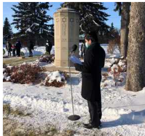
Remembrance Day Ceremony at the Jewish Cemetery