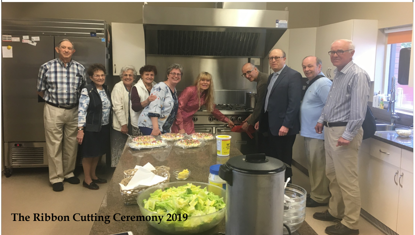
The Ribbon Cutting Ceremony 2019