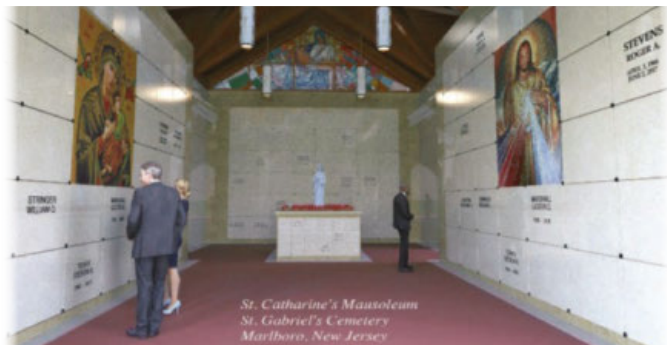
St. Catharine's Mausoleum St. Gabriel's Cemetery Marlboro, New Jersey

www.stgabrielismausoleums.com | 908-208-0786