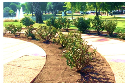
Palm Desert Rose Garden fall pruning