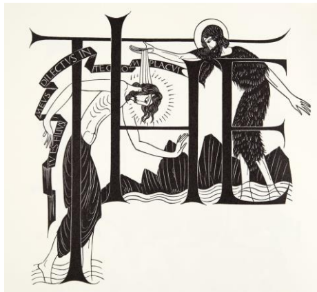
Wood engraving, Eric Gill, 1929

Those wishing to enjoy the Postlude are encouraged to remain in their pews. We ask that others kindly move to the parish hall for conversation and socializing.