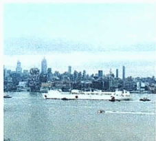
Navy Ship “Comfort” in NYC harbor (left)

conversation topics! Donations, charities, food sharing, home schooling and isolating , became important words and events to live by.