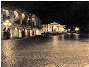
<The Colosseum. Lonely streets, Rome

of seeing...on restaurants, shops, schools, clubs and churches as well.