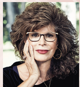
SHOSHANA ZUBOFF, PhD