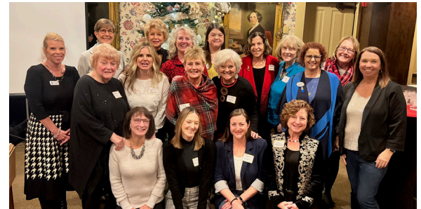
The WCF Women's Fund provides annual grants to organizations supporting women and children.