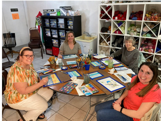
Artscape Lebanon is one of the Warren County arts organizations that is receiving generous funding through the ArtsWave and WCF collaboration.

"ArtsWave is excited to deepen our partnership with Warren County's vibrant arts and cultural organizations. From ArtsScape Lebanon to the Harmon Museum to the Warren County Foundation, these groups play a vital role in enhancing the region's quality of life through the arts. By strengthening these connections, we're not only supporting the creative community but also making it easier for residents to direct their contributions towards organizations and events that shape the cultural landscape of Warren County."