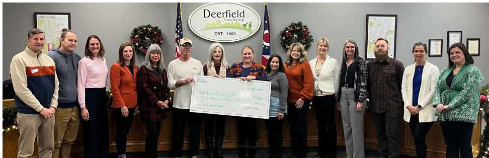
Duke Energy Foundation grants were awarded to 7 small businesses in Deerfield Township by the WCF in December 2024

The Duke Energy Foundation and Warren County Foundation have partnered together for 3 years to provide $77,500 through 56 grants for small businesses in our community. WCF and Duke Energy will partner again in 2025 to provide small business grants in Warren County.