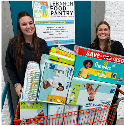
Family Dentistry colleagues contribute donations for the new 'Free Convenience Store'

The Lebanon Food Pantry recently received a $7,000 Impact Grant from the Warren County Foundation to support families facing food insecurity. The grant will be directed to partially fund the "Free Convenience Store," which gives neighbors coming to the pantry a choice of personal care and household cleaning items. It will support neighbors visiting Lebanon Food Pantry and will collectively serve more than 18,700 individuals in 2025.