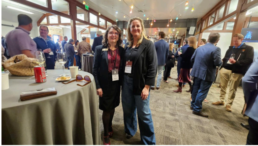
Napa Valley Vintners: Premier Napa Valley Event