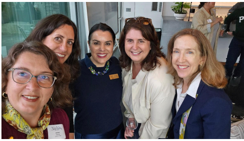
Great Wine Capitals "Best of Club" Celebration 2026