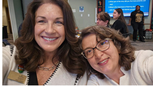
HHS Black History Month Event