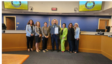
The Board presented a proclamation recognizing September 2025 as “National Recovery Month” in Napa County