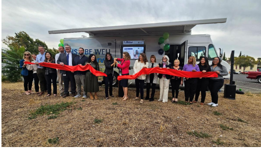
Ribbon Cutting for the Grand Opening of the Be Well Mobile Services