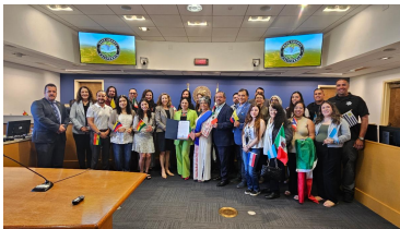
The Board presented a proclamation recognizing September 2025 as “Hispanic Heritage Month” in Napa County