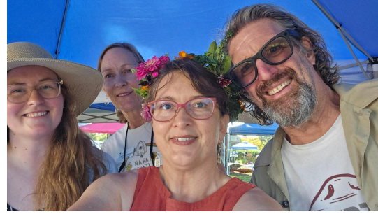
Master Gardeners Fall Faire