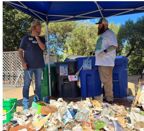
Coastal Clean up Day