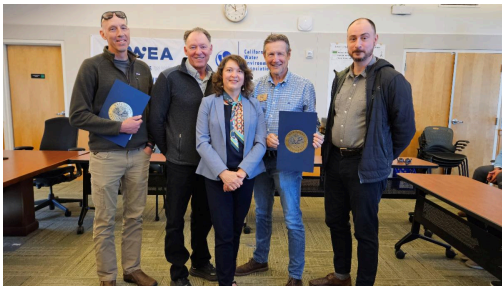
World Wetlands Day 2026