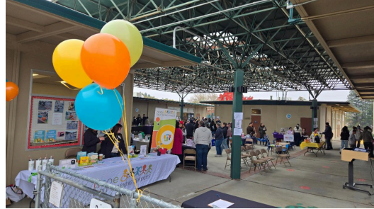
NCOE Early Learning Center Grand Opening