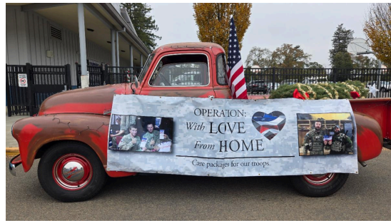
Operation with Love from Home