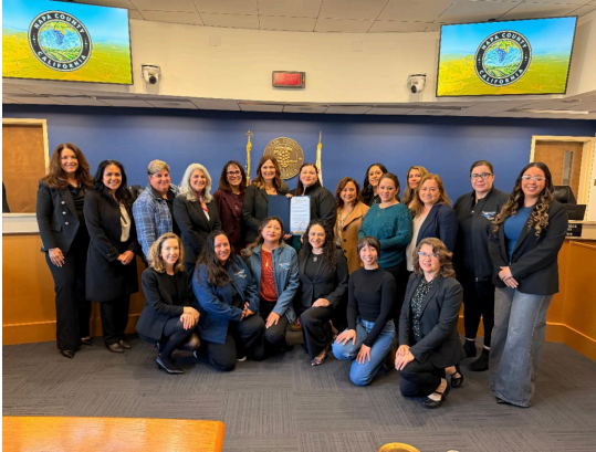
The Board of Supervisors presented a proclamation recognizing January 2026 as "Positive Parenting Awareness Month."