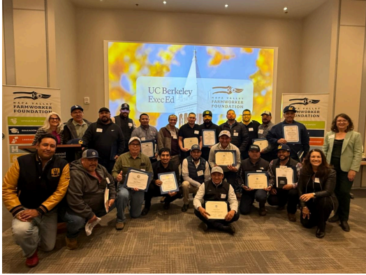
Cultivar360 Graduation Ceremony