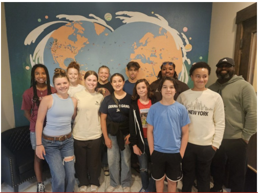
Youth Service-Learning Experience and Fun Day