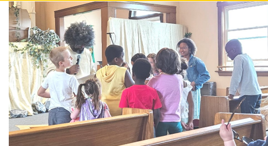
Summer Bible Adventure

Christ in Our Home Would you like to receive a copy of the daily devotional “Christ in Our Home”? Pick one up from the table outside the sanctuary, or contact Damishe in the office.