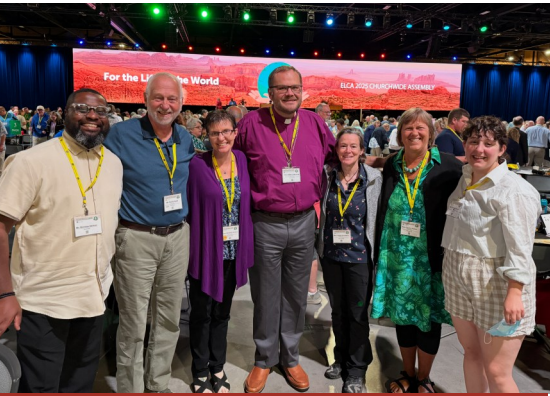
ELCA Churchwide Assembly