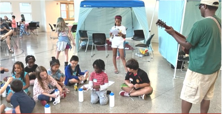
Summer Bible Adventure - Compassion Camp!

We worship Sundays at 8:30 & 11 am. Masks are welcome and encouraged but not required. We require masks the first Sunday of each month for 8:30 am worship so those who need to take additional precautions can participate. If you are experiencing symptoms of illness, please stay home and worship online. Join live stream Sunday worship at 11 am on the church Facebook page (worship video also available later on the YouTube channel).