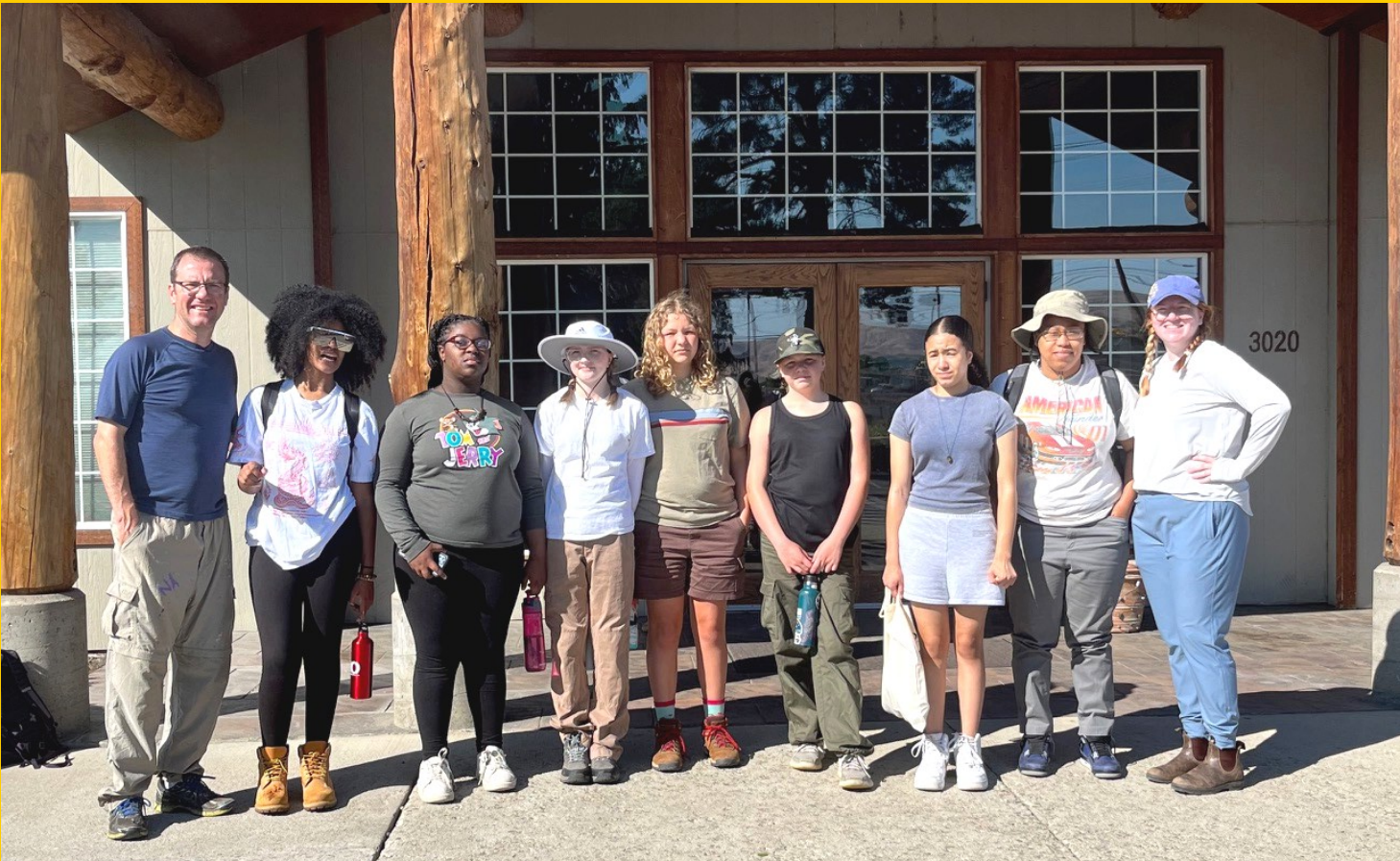
Peace youth and adults who participated in the servant learning mission trip with Mending Wings.