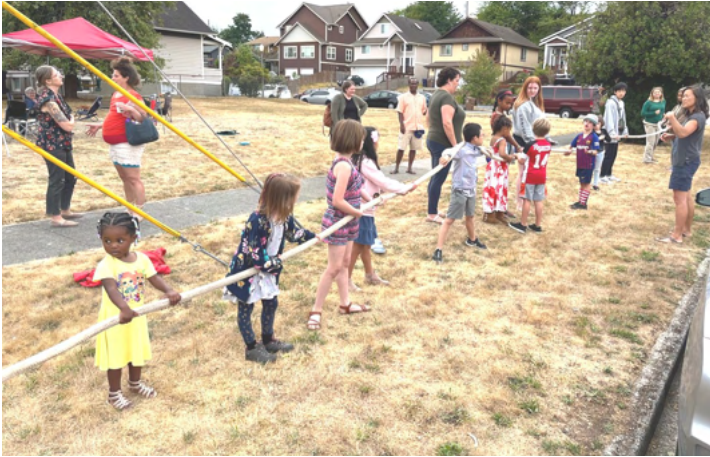
Outdoor Worship and Outdoor Community Games!