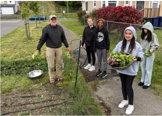
Youth harvesting lettuce for salad for a Community Meal at Peace