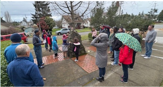
Lent Hilltop Prayer Walk to the All Lives Are Precious monument