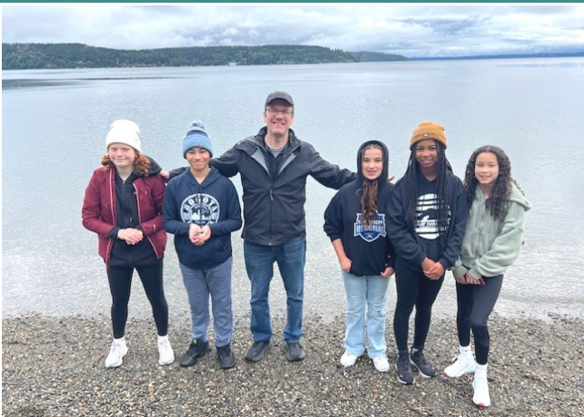
Feet to Faith Youth Retreat at Point Defiance