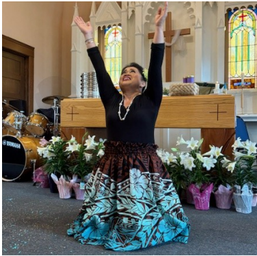
Easter Sunday Worship! Christ is risen!