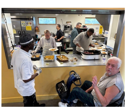
Mother's Day at Peace