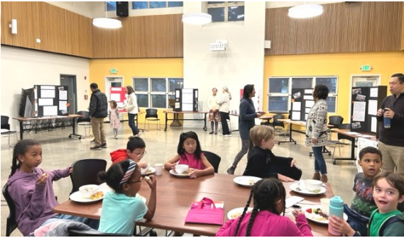
Ministry Fair at Peace - All Hands on Deck!