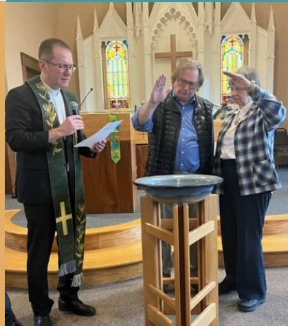
Thanksgiving for Baptism and Blessing the New Baptismal Font

“For a child has been born for us, a son given to us; authority rests upon his shoulders; and he is named Wonderful Counselor, Mighty God, Everlasting Father, Prince of Peace.” – Isaiah 9:6