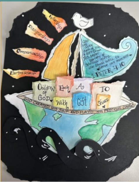
“All Hands on Deck!”