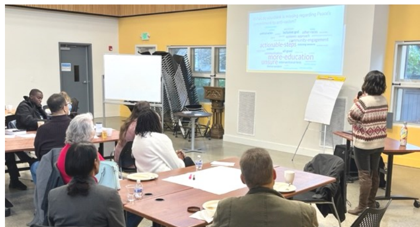
Presentation and Conversation led by the Anti-Racism Work Group