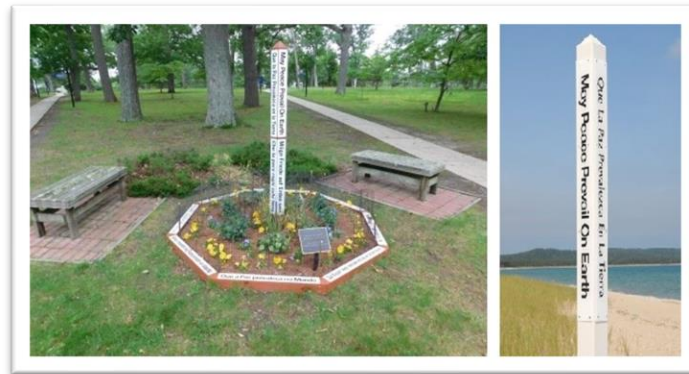
EXAMPLE OF A PEACE POLE