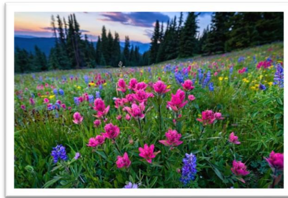
Field of Flowers, Vail, CO

Spring is here! The beauty of the season brings along its colorful nature and lights up the sky to enwrap around us.