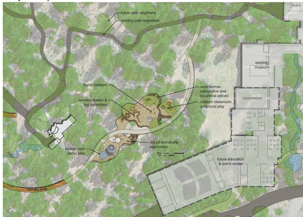
Play Concept - Ponderosa Forest