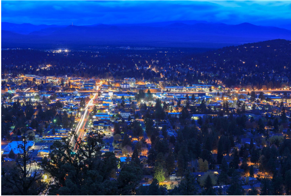
Bend from Pilot Butte.

Some people will harrumph and scrunch up their faces if you mention tourists and Bend.