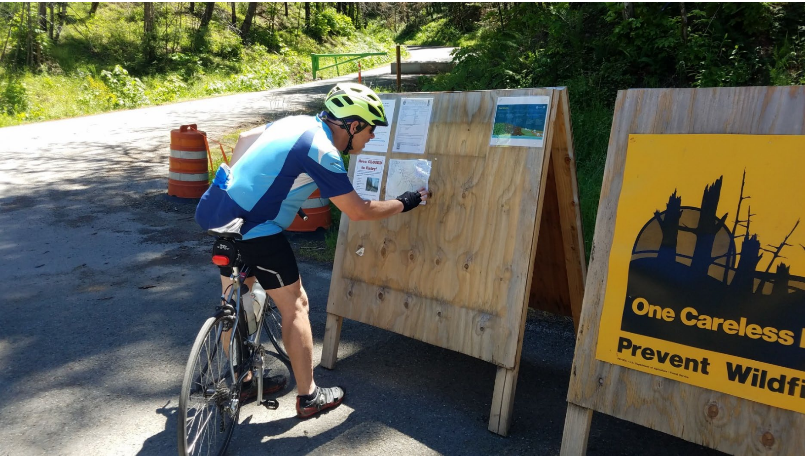
Above: Cyclist consults the asset map at the entrance to reopened Hwy 224

Our open recreation asset map and additional safety information is also posted roadside at the entrance to the reopened section of Hwy 224, serving many types of recreational visitors.