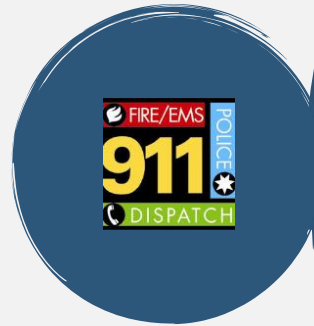
Public Safety Dispatch/Records