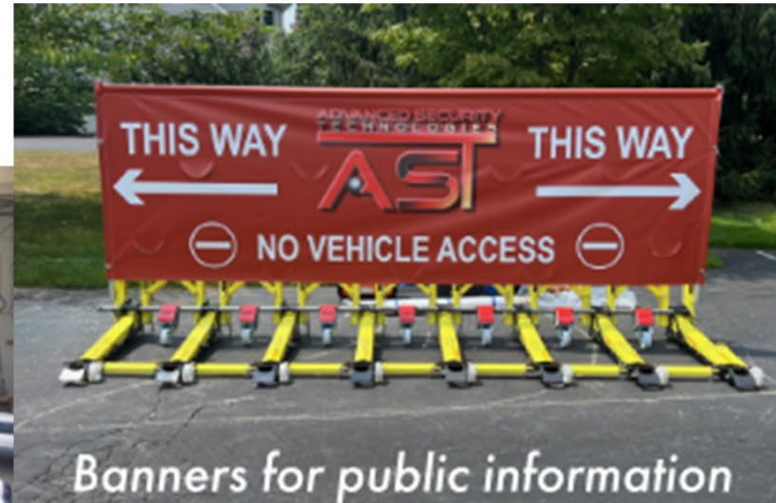
Banners for public information