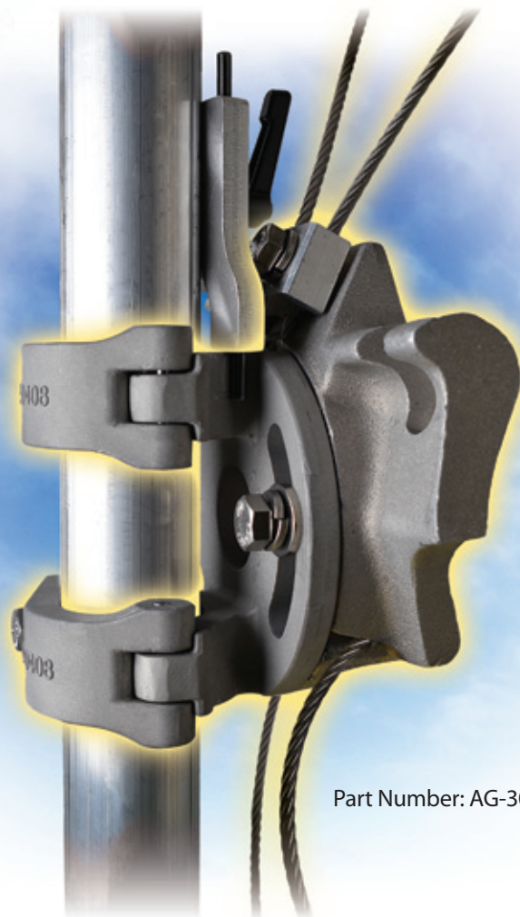
Part Number: AG-3055