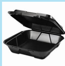
R0822— Propak, 2/100Cnt Container Foam Hinged Large 9.25X9.25 Black Snap It