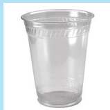
23060—Propak, 20/50Cnt Cup Plastic Polyethylene Terephthalate 16-18 Ounce Clear Rfs# D6520 For Lid