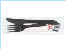
BV818—Max Packaging Cutlery Kit Hvy Knife Fork Salt Pepper Napkin Blk 250/ct