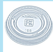
22646— Propak, 20/125 Lid Plastic Souffle Clear Fits .75 Ounce -1 Ounce Cup