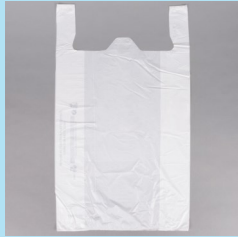
P8762— Allied PolyBag Plastic T-sack Mega 13X10X21 1000/ct