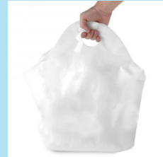
CB334—Propak Bag Plastic Delivery Tamper Evident 21X19X10 250/ct