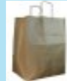
HA212—Duro Bag Paper Regal Shopper Kraft 65# 12x9x15.75 with Handle 250/ct