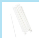
CA170—Propak Straw 7.75" Jumbo Paper Wrapped clear 24/500 ct