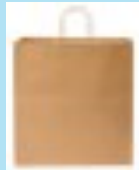
F9466—Duro Bag Bag Paper 14x10x15.75 with Handle Kraft 200/ct