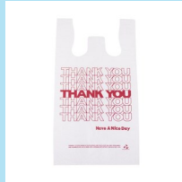
CB334— Hilex Bag Plastic T-sack 1/6 Barrell Thank You 11.5X6.5X21 1000/ct