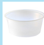
22988—Propak, 20/125 Cup Plastic Souffle 4 Ounce Translucent Lid Rfs# 22734