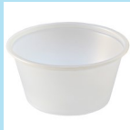
83428— Propak, 10/250 Cup Souffle Plastic 2 Ounce Translucent For Lid Rfs #22696