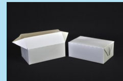
T6734—Southern Champion Tray, 500/CntBox Carry Out Chicken Fast Top 7X4x2.75 White