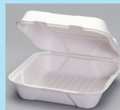
82556— Genpak, 4/50Cnt Container Harvest Fiber Hinged Natural 1 Compartment 9.2X9.1X3.1 Compostable