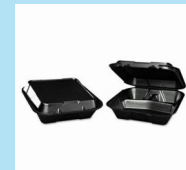
BD030— Genpak, 2/100Cnt Container Foam Hinged Large 3 Compartment Snap It Black