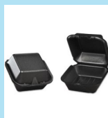
T1734— Propak, 4/125Cnt Container Foam Hinged Sandwich 5.8X5.6X3.12 Black