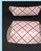
A1740— Southern Champion Tray, 2/250Cnt Tray Paper Food 3 Pound Red Plaid Check