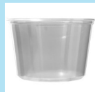
BW692—Propak, 10/50Cnt Container Plastic 16 Ounce Deli Clear