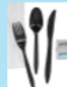
CA130—Cutlery Kit Plastic Polypropylene Medium Weight Knife Fork Spoon Napkin Salt & Pepper Individually Wrapped Black 250/ct