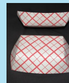
G0372— Southern Champion Tray, 2/250Cnt Tray Paper Food 5 Pound Red And White Diamond Check