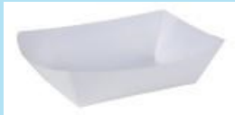
BV742— Southern Champion Tray Paper Foods .5 lb 4.6X3.2X1.25 White