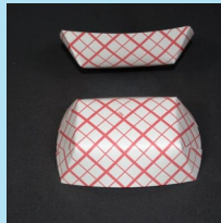
82244— Southern Champion Tray, 4/250Cnt Tray Paper Food 1 Pound Red Check