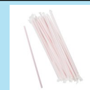
CW588—Cell-O-Core Straw 7.75" Jumbo White Red Paper Wrapped clear 4/500 ct