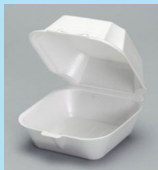
B9176— Propak, 4/125Cnt Container Foam Hinged Sandwich