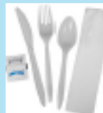
CA124—Propak Cutlery Kit Plastic Medium Weight Knife, Fork, Spoon, Napkin, Salt & Pepper Individually