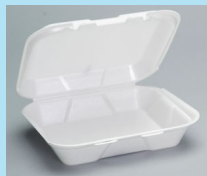
C1752— Genpak, 2/100Cnt Container Foam Hinged 1 Compartment 8.4X7.6X2.4 White