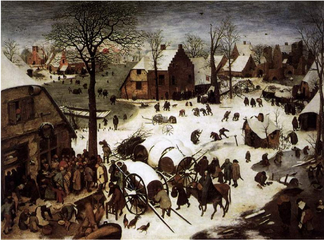
Pieter Bruegel : The Census at Bethlehem , 1566