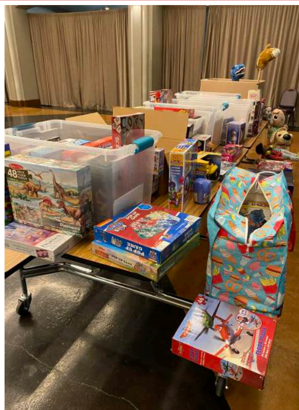
Christmas presents for the kids (donated toys and games).

December volunteers from top left to bottom right: