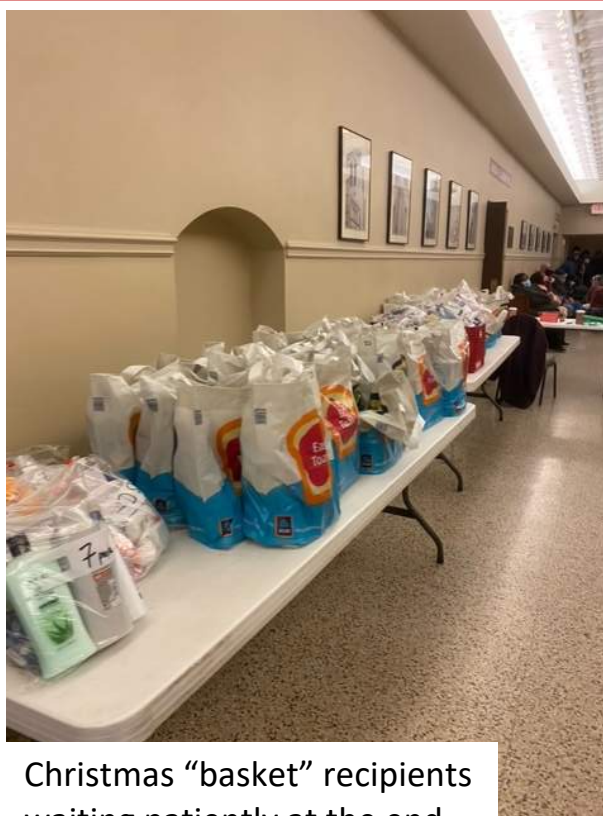
Christmas “basket” recipients waiting patiently at the end of the hall for their turn to collect December items.