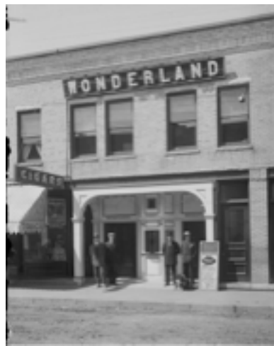
Whitney’s “Wonderland” Theater, 1908