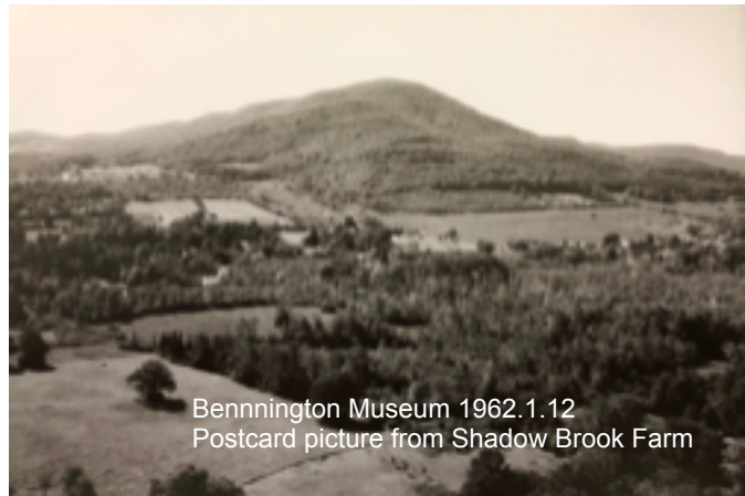
Postcard picture from Shadow Brook Farm