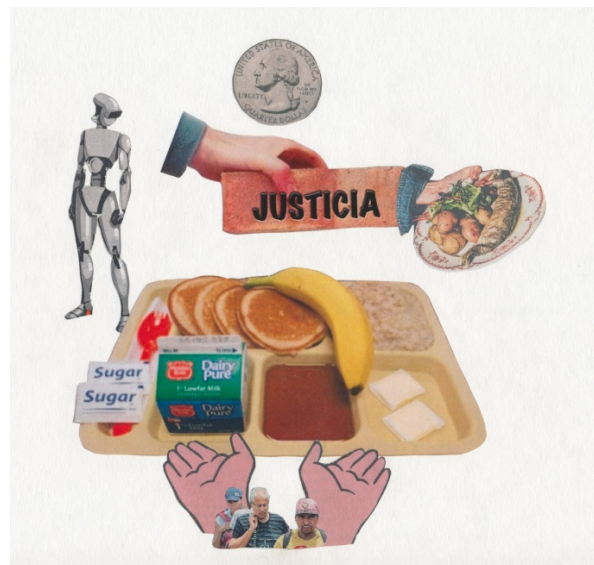
Cinthya Santos-Briones , Spaces of Detention, Work in Progress

*Client's name has been changed to protect anonymity.