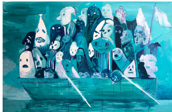
Edel Rodriguez's "Strangers," 2018