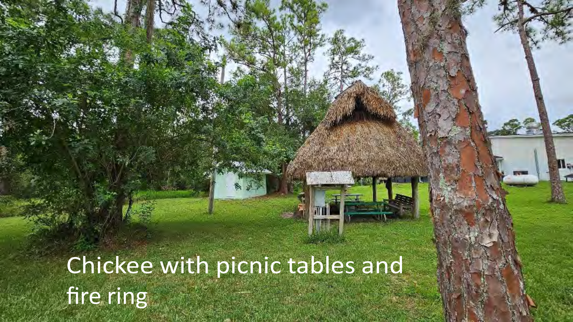
Chickee with picnic tables and fire ring