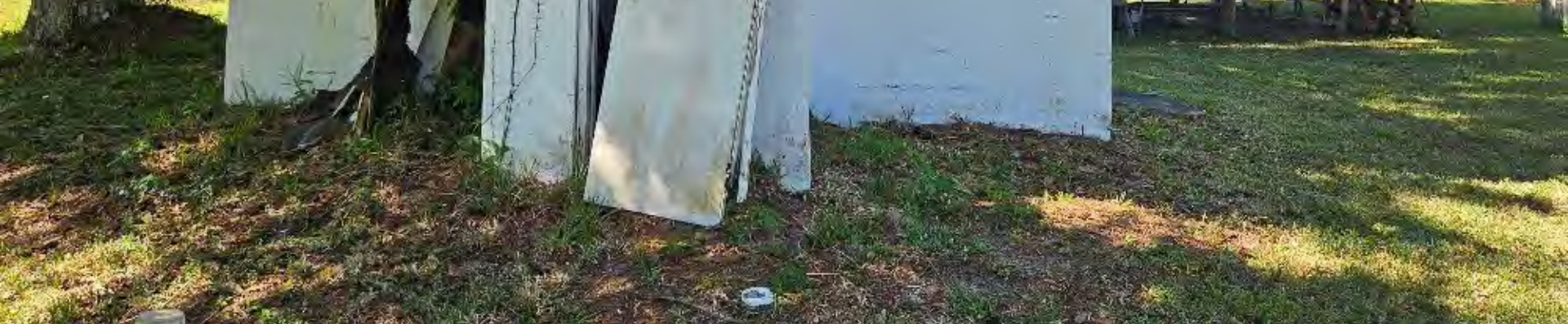
Front (West Side) Back (East Side)