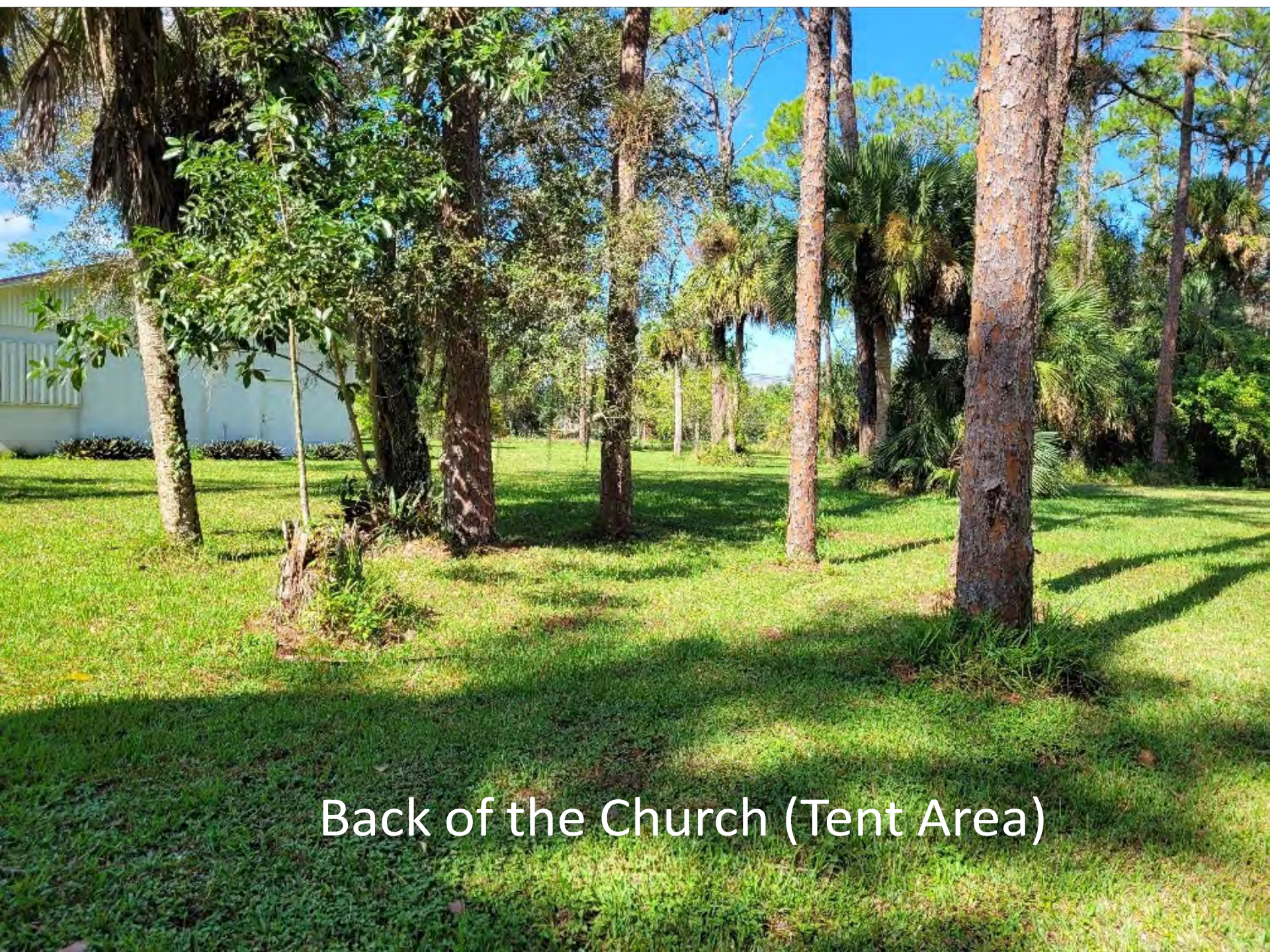
Back of the Church (Tent Area)