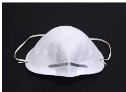
Surgical face mask

If you live in an area with damp weather (and basements) during part or most of the year — and especially if you work with properties that might not have been kept up for a while — then you may want to pack a disposable face mask to protect your lungs from whatever is in the air at that listing.