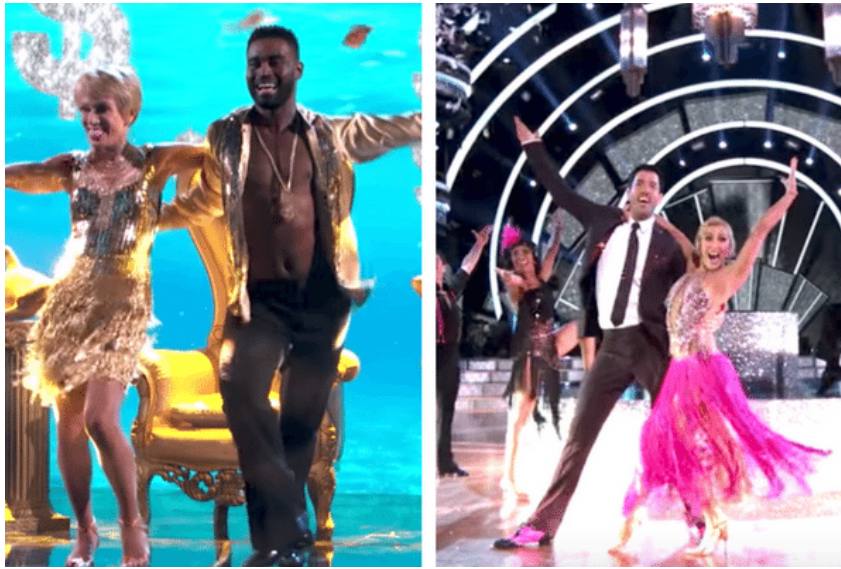
Barbara Corcoran (left) and Drew Scott on DWTS