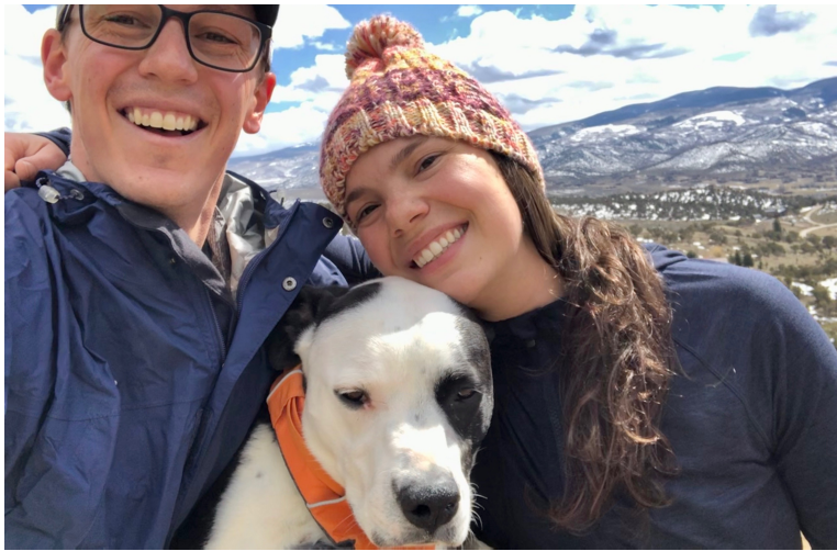
Hiking Redneck Ridge above the Town of Eagle today!

The purpose of today's newsletter is to provide you all with important updates and resources. If you cannot find what you need below, please contact me.