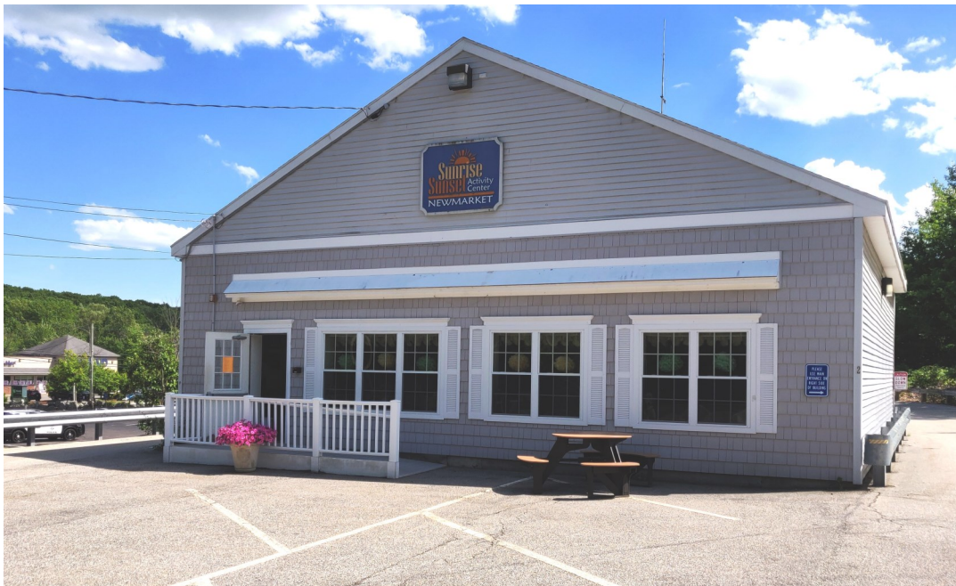
Sunrise Sunset Activity Center - 2 Terrace Drive - Newmarket, NH 03857