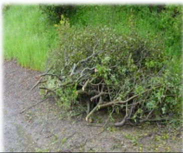
1. Leave cut vegetation adjacent to curbside with cut ends out.

The Pacific Vegetation Reduction Chipping Program is based on a "you cut, we chip" model. Residents are responsible for cutting, gathering, and piling vegetation from around their homes to a roadside or drop-off location. We will provide chipping crews who visit identified streets to chip piled vegetation for removal. Chips will be hauled off at no cost resident. No signup or registration is required.