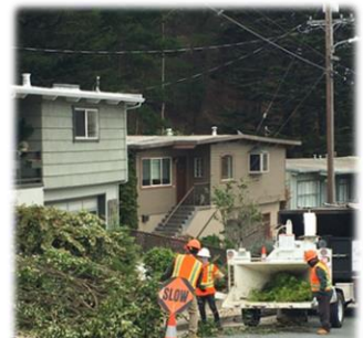
3. Wait for chipping crews to remove materials.

The Pacifica Vegetation Reduction Chipping Program was made possible through collaborated support of North County Fire Authority, the City of Pacifica, and Coastal Conservancy grant funds.