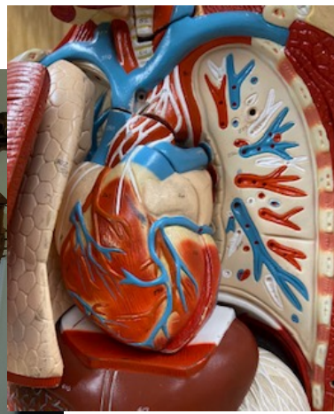
Harvey, our human torso, shows off his heart and lungs in this close up photo.

This spring, inside exhibits will be a one-way walk through, just for looking and learning.