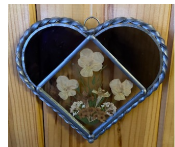
Stained glass and pressed flowers combine to fashion a beautiful heart.

Take care of yourselves and again, Happy Valentine's Day, Cheri