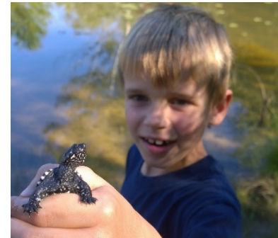
Choose science, history or art camps. Even art classes, like Marbled Paper (left) will be held safely outdoors with campers masked and socially distanced.

Fifth, the third annual PEDAL, PIG & PINT BIKE EVENT is scheduled for Sunday August 1, 2021 . Riders are welcome to enjoy this self-paced bike event accessible to all ages and riding abilities. Mark your calendars and watch for more information. This year's bike event is expanding to include both the road bike tour and a mountain bike component. Raven Hill Discovery Center www.miravenhill.org and the Top of Michigan Mountain Bike Association (TOMMBA) www.tommmba.org are collaborating to bring you the opportunity to "Choose Your Wheels". Enjoy a scenic paved route around Lake Charlevoix OR delight in beautiful wooded mountain bike trails. Your support will go to two exceptional non-profit organizations striving to enhance outdoor experiences in this area. Stiggs Brewing Company in Boyne City has generously offered to support the event with a Pig Roast, Pint and festive atmosphere for relaxing after your ride.