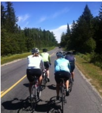
Sign up. Then get on your bike & enjoy a ride around Lake Charlevoix to support Raven Hill.

Fifth, the third annual PEDAL, PIG & PINT BIKE EVENT is scheduled for Sunday August 1, 2021 . Riders are welcome to enjoy this self-paced bike event accessible to all ages and riding abilities. Mark your calendars and watch for more information. This year's bike event is expanding to include both the road bike tour and a mountain bike component. Raven Hill Discovery Center www.miravenhill.org and the Top of Michigan Mountain Bike Association (TOMMBA) www.tommmba.org are collaborating to bring you the opportunity to "Choose Your Wheels". Enjoy a scenic paved route around Lake Charlevoix OR delight in beautiful wooded mountain bike trails. Your support will go to two exceptional non-profit organizations striving to enhance outdoor experiences in this area. Stiggs Brewing Company in Boyne City has generously offered to support the event with a Pig Roast, Pint and festive atmosphere for relaxing after your ride.