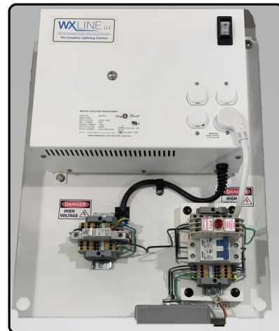
Wxline Isolation Transformer (WxIT) in Fiberglass Enclosure