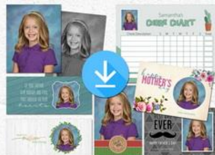
Image Pack Deluxe Digital Download (includes templates, all backgrounds and unlimited copyright release)