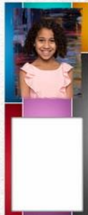
4x10 Locker Magnet