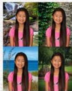
4 - 4x5 Magnet Sheet (w/outdoor backgrounds shown)