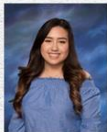
8x10 Traditional No borders or personalization Order Code TT