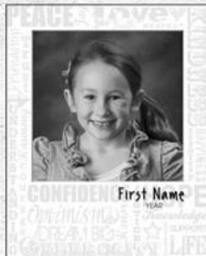
Word Art Print