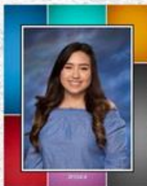
Color Block Border Order Code CB