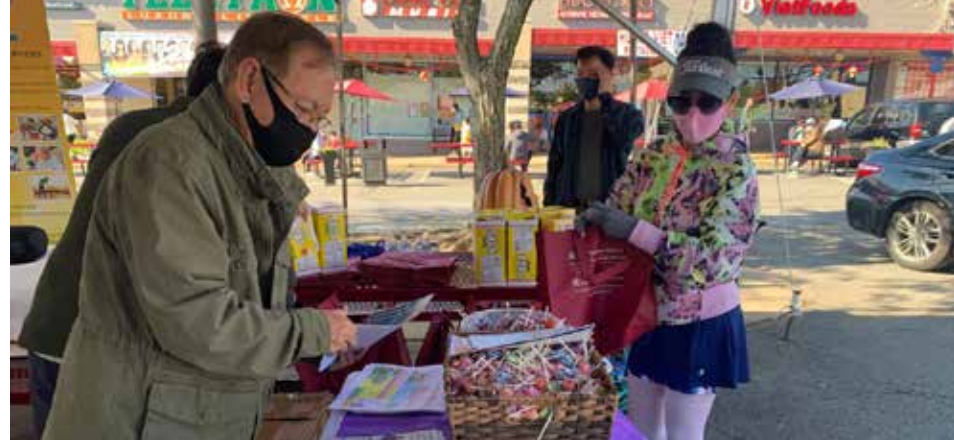
October 17 th : "Nha Sach Signing" outreach event with VLAC, Fairfax County and CarePeople