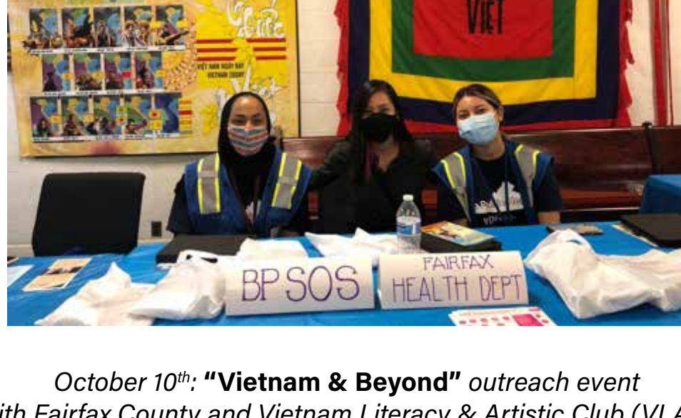
October 10 th : "Vietnam & Beyond" outreach event with Fairfax County and Vietnam Literacy & Artistic Club (VLAC)

In October, BPSOS program coordinators and our partners collaborated to conduct 2 vaccination clinics for our community as well as 2 other outreach events: "Vietnam & Beyond" and "Nha Sach Signing" in Eden Center.