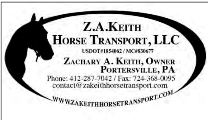
Series Class Sponsor - First Level, Test 1

In memory of all the horses that have gone ahead of us... who have trusted us, taught us, loved us, and changed us forever.