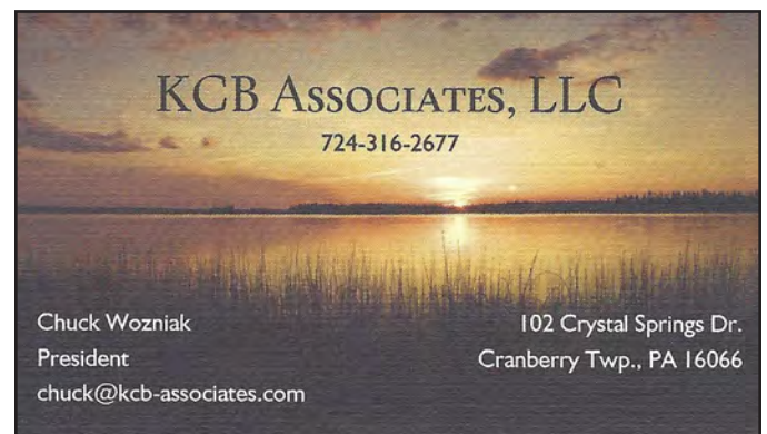
August 17 Class Sponsor - Training Class, Test 3