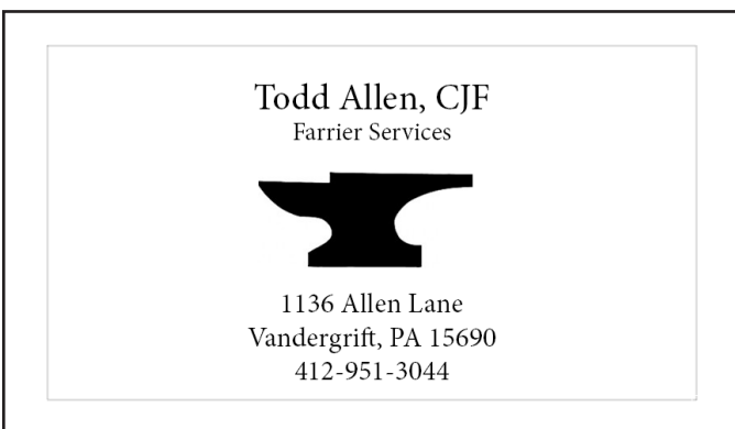
June 29 Class Sponsor - Intro Level, Test B August 17 Class Sponsor - Intro Level, Test C